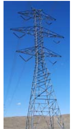
Vertical, 500/230 kV, double circuit