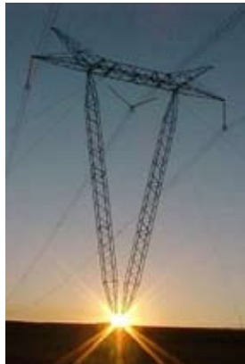
Horizontal guyed V, 500 kV