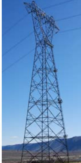
Horizontal, river crossing, 500 kV