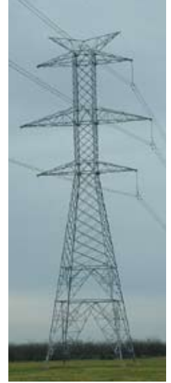
Vertical, 345 kV, double circuit (one circuit installed)