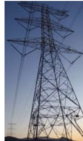
Vertical, 400 kV, double circuit