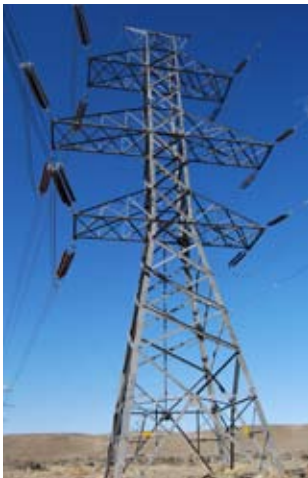
Vertical dead end, 500/230 kV, double circuit