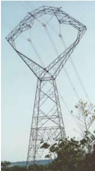
Internal compact delta, 500 kV