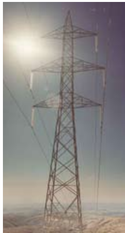
Vertical, 230 kV, double circuit