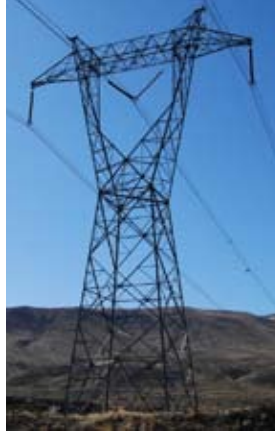
Horizontal, 500 kV

We produce guyed and self-supporting delta and flat towers for single, double and multiple circuit configurations ranging in voltages from 69 kV to 765 kV. Drawing on an extensive database of tower designs going back more than 40 years, we are able to expertly design and manufacture towers for all terrains, environments and operating conditions. Our expertise covers the full range of tower types, including tangent and running angle suspension, strain and dead end towers. We are the go-to provider in the Americas for difficult river crossings and other complex challenges. All of our tower structures are optimized for weight efficiency and constructability in order to minimize total in-place cost.