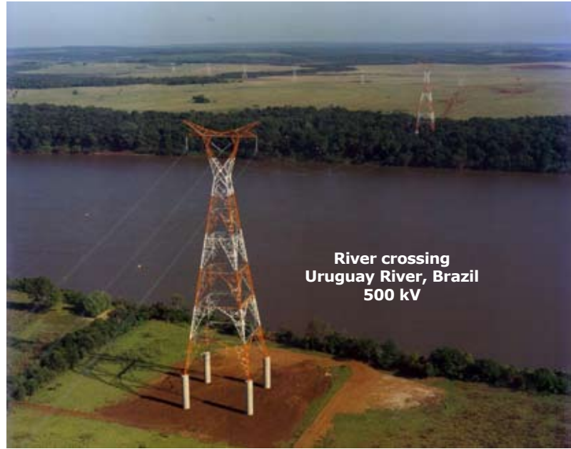
River crossing Uruguay River, Brazil 500 kV

Additional sales, engineering design and customer service operations are located at corporate headquarters in Houston, Texas.