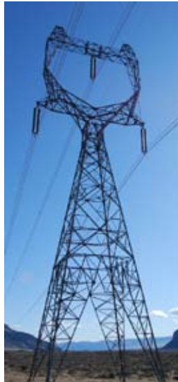
Delta, 500 kV