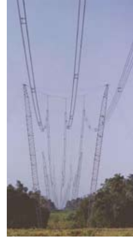
Crossrope suspension, 500 kV