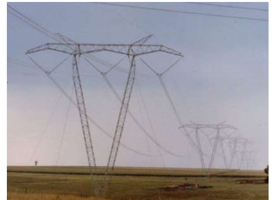
Horizontal guyed V, 765 kV